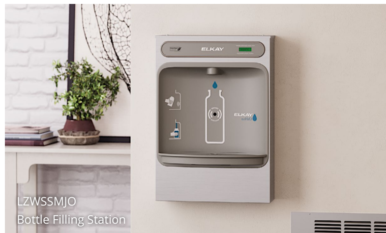
LZWSM82K Bottle Filling Station

Top: LBWD2C00BKC Liv Pro Water Dispenser; Bottom-left: LZWSM82K Bottle Filling Station In-Wall; Bottom-right: LK4430BF1UEVG Bottle Filling Station Pedestal