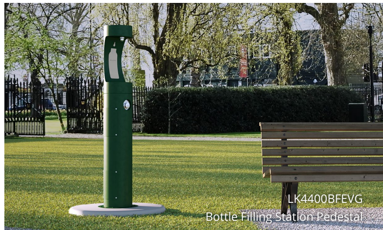
LK4430BF1UEVG Bottle Filling Station Pedestal