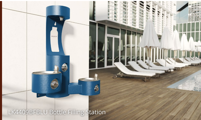
LK4409BFBLU Bottle Filling Station

From bottle filling stations to water coolers and fountains, our filtered and vandal-resistant drinking water products offer the ultimate solution for your hospitality environment.