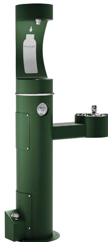
LK4420BF1UEVG Bottle Filling Station 4481FPEVG Foot Pedal

Increased corrosion resistance makes this product ideal for high-saline environments such as coastal regions and outdoor areas where de-icing salts are common.