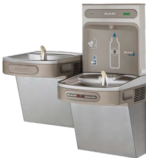
LZSTL8WSJOCX Modified with EZO Sensor Electronics on LOWER cooler + LZWSRJO