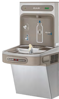
LZS8WSJ0X Modified with EZO Sensor Electronics+LZWSRJO

When your needs for water delivery go beyond the norm, Elkay's got it covered. In addition to our standard hands-free portfolio, we can construct no-touch, sanitary, sensor-activated bottle filling stations to meet your specific needs.