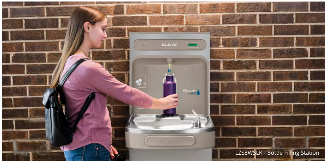
LZS8WSLK - Bottle Filling Station

Drinking water supply solutions for every need