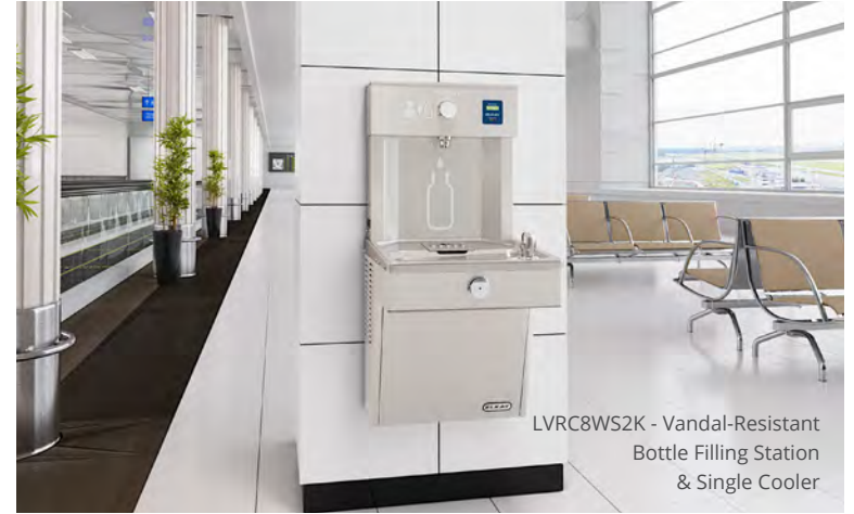
LVRC8WS2K - Vandal-Resistant Bottle Filling Station & Single Cooler

Fill rate is 1.1 GPM for refrigerated units and 1.5 GPM for non-refrigerated units.