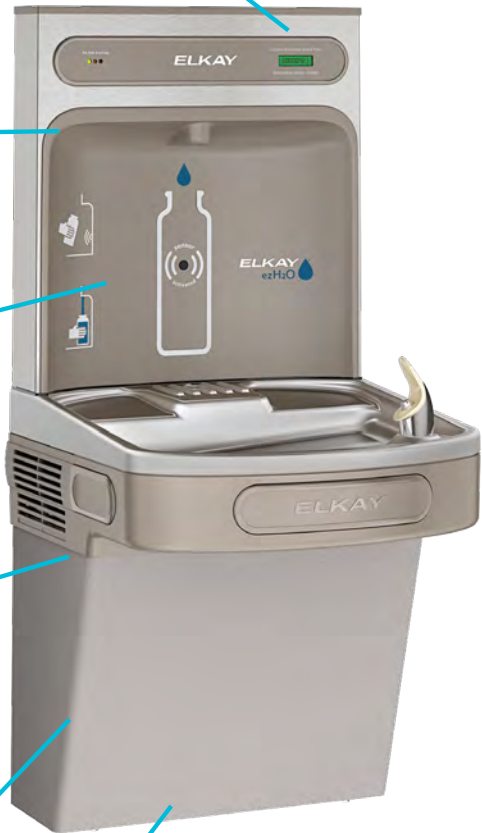
LZS8WSL2K Hands-free Bottle Filling Station & Single Cooler

Silver ion antimicrobial protection on key plastic components to inhibit the growth of mold and mildew.