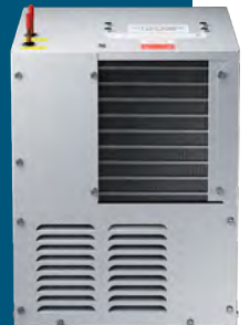
ECH82 Remote Chiller

In factories, save floor space and protect the water chiller from damage by installing the chiller overhead and out of the way.